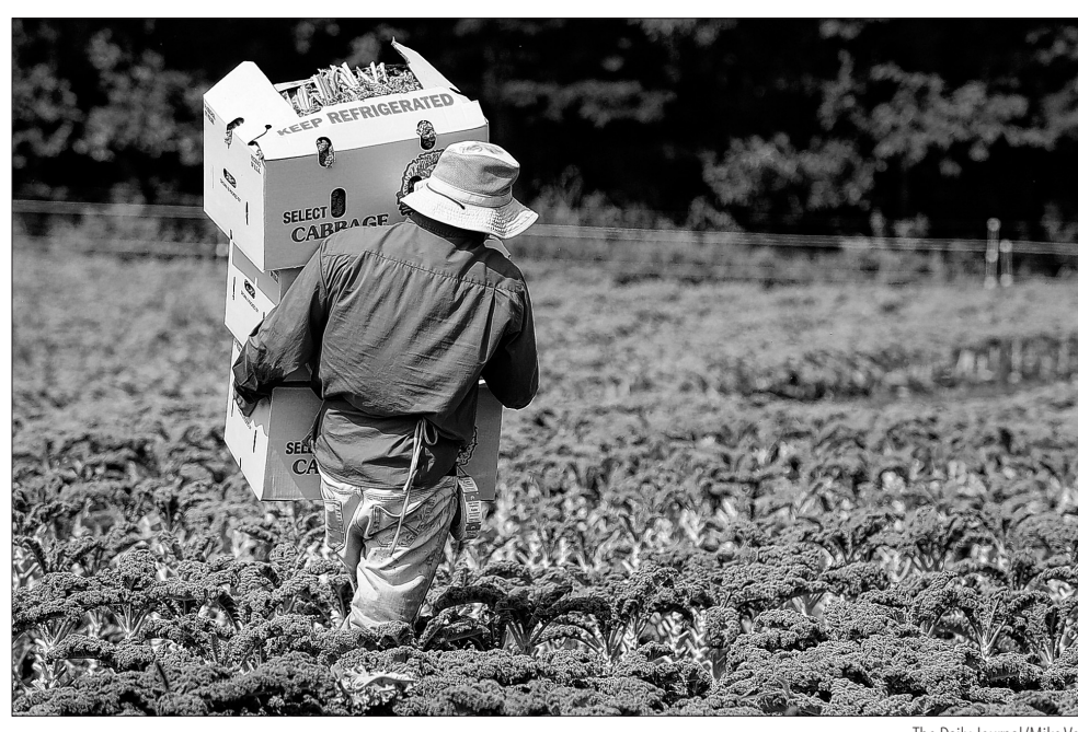
A worker carries cartons of freshly picked kale from a field at Deer Creek Organics in St. Anne.

He didn't quit during his first 100-hour work week. Or his second.