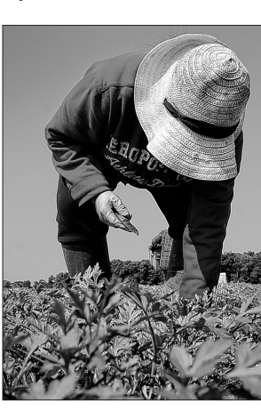
A worker harvests Italian

The secret to their viability is infrastructure born of